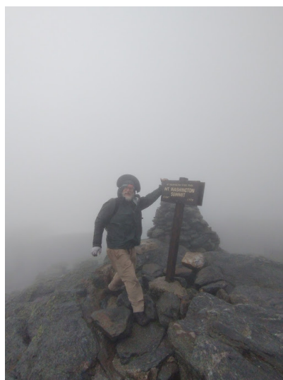
On Mt. Washington