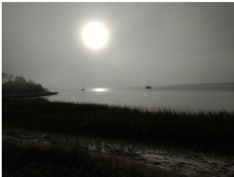
Boats off Jekyll Island

John and Charles Wesley and George Whitfield ministered on St. Simon's Island across the channel.