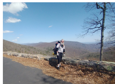
Shenandoah National Park

If you're curious about what Mark Twain would have said about cryptocurrency, or if you want to read an original Latin poem about Pete Rose, check out