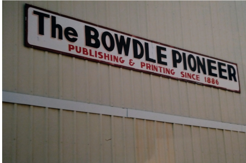
Figure 1: Newspapers-R-US